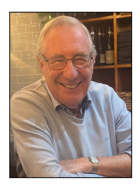
A CELEBRATION FOR THE LIFE OF